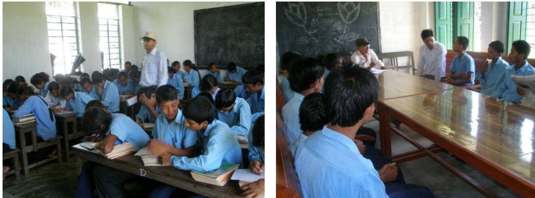
Figure 6 Orchid Conservation talk program in schools

A problem tree was formed to show the causes of orchid destruction in the region. Problems tree showed that excessive use of orchids for ornamental purposes, clearing of orchids during the forest management operation, exploitation of orchids for fun by picnickers and hikers, use of orchids as compost manure are some of the main reason for the extinction of orchids from the wild.