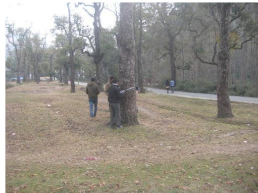
Figure 12 Participatory identification and preservation of orchid host tree

The forest was dominated by Schima castonopsis . The host trees identified in the forest were