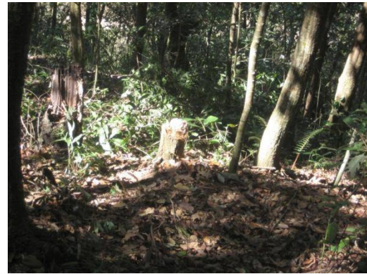
Figure 11 Destruction of orchid host trees