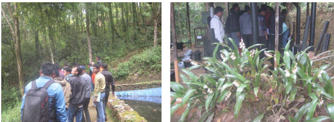
Figure 9 Orchid conservation excursion in the Botanical Garden

A conservation excursion was organized which include few talented students and influential villagers. The excursion was organized in a local forest area and National Botanical Garden located in the Godavari. The objective of the excursion was to make students identify some available species of orchids in their local forest area and get some idea on orchid conservation. The excursion was organized in the morning so that villagers can join irrespective of their daily schedule and they can watch bird species in their forest. The participant especially students were delighted to see different varieties of orchids in the orchid garden located inside the national botanical garden. They were also taken to the nearby forest that was managed by local community. In such excursion the fallen orchids were collected which were relocated with the help of students and villagers.