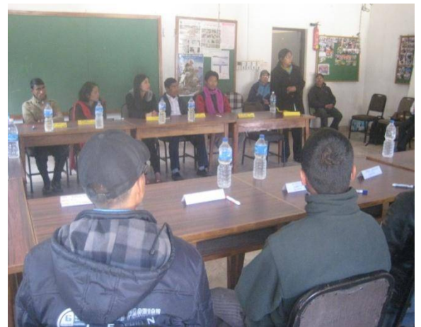
Figure 5 Community networks for understanding orchid ecology and conservation