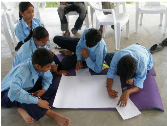
Figure 7 Problem tree formation exercise to show the causes of orchid destruction in the region

A problem tree was formed to show the causes of orchid destruction in the region. Problems tree showed that excessive use of orchids for ornamental purposes, clearing of orchids during the forest management operation, exploitation of orchids for fun by picnickers and hikers, use of orchids as compost manure are some of the main reason for the extinction of orchids from the wild.