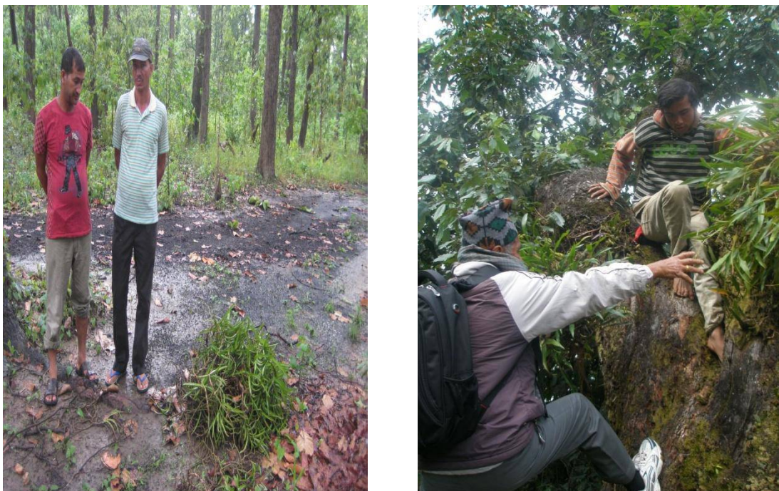
Figure 10: Orchid rehabilitation/relocation