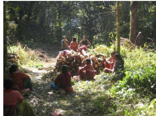
Figure 4 Discussions with Picnickers/Hikers/wood cutters on ecology and conservation of orchids