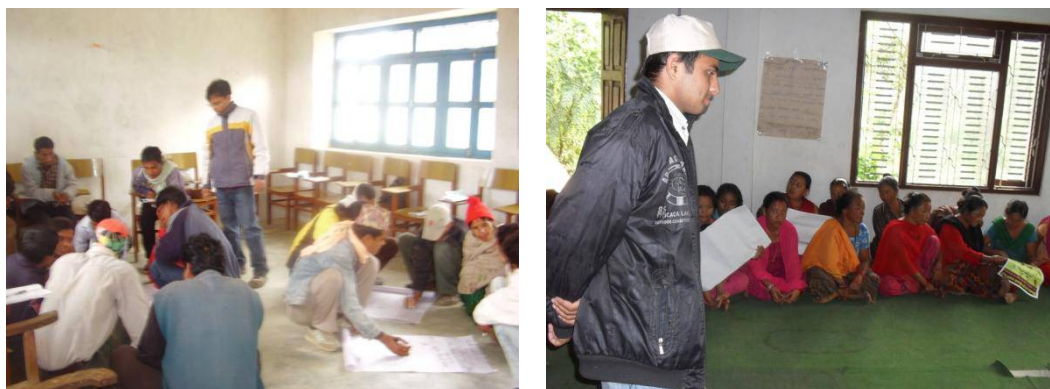
Figure 8 Public talks on ecology and conservation of orchids

The forest management plan of the two users groups were participatory analyzed and discussed. None of them had any provisions related to the conservation of wild flowers (rhododendron) including orchid resources that were found abundantly in their forest. When the importance of orchids and its sustainable collection measures were discussed with the committee members and the villagers, they were empowered and committed to include some binding provisions and management options for orchids in subsequent amendment of their CFUGs plans.