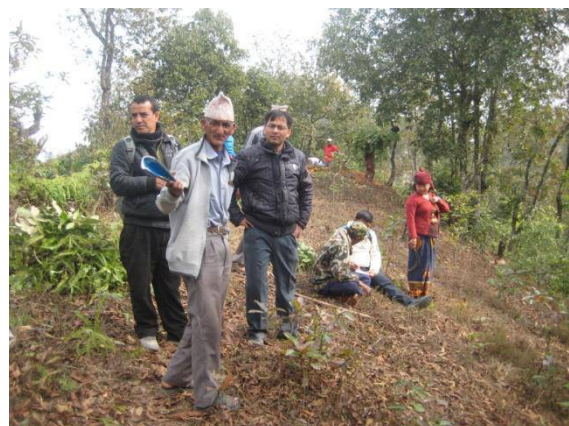
Figure 2 Interaction with local authority and villagers