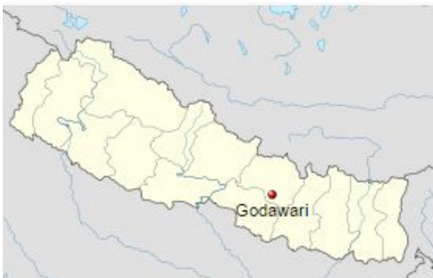
Figure 1 Map of the project site

Godawari is a southernmost part of the Kathmandu valley. It has a population of 15,572 in 1,825 individual households. It is one of the popular hiking destinations in Nepal for its rich wildlife and splendid environment. Nestling at the foot of forested Phulchoki, the highest peak of the valley rim, it is a gorgeously rural side-valley.