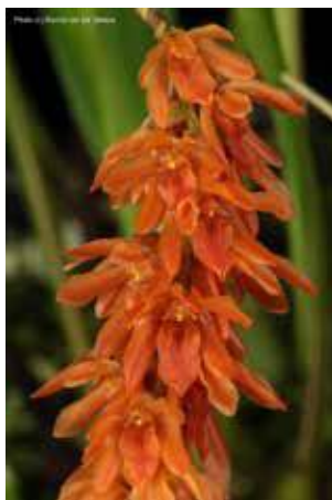
Dendrochilum longilabre 'Goodstuff' species