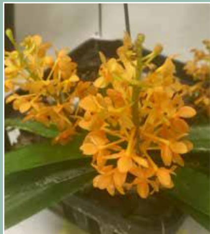
Vanda garayi (Ascocentrum garayi)