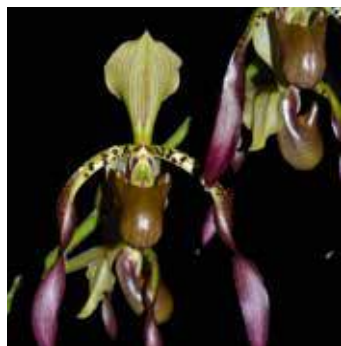
Paphiopedilum Robinianum 'Tiny Jungle'

( Paphiopedilum lowii x Paphiopedilum parishii ) AM 86