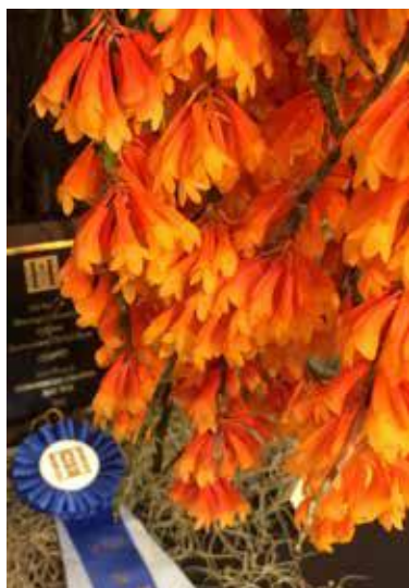
Dendrobium subclausum Jojo's Fire

Orchids of Colombia Orchids in the Wild tour: The Orchid Conservation Alliance will lead a tour to Colombia. The trip will focus on the spectacular orchids of the northern Andes, several nurseries, and a visit to a new OCA sponsored reserve. Reservations are being accepted now; a $500 deposit, payable to OCA holds your space the trip. www.orchidconservationalliance.org