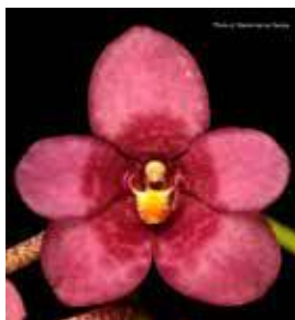
Sarco. Kulnura Symphony 'Grass Valley'

( Sarco. Elegance x Sarco. Bunyip ) AM 80