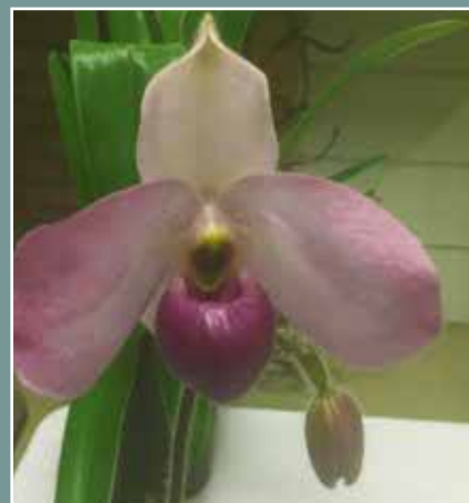
Paph. Ho Chi Minh Dale Martin