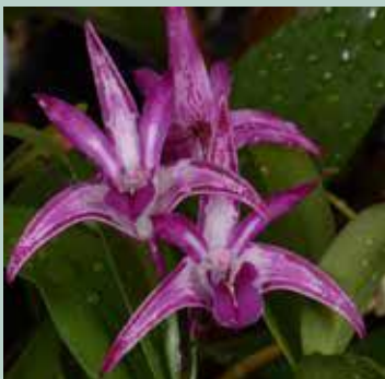
Den. Purple Cluster (Rubens) x Den. (Aussie Charm x Zip) (SVO)

American Orchid Society Judging: Begins at 7:00pm. (Enter plants for AOS Judging between 6:30 and 7:00 pm)