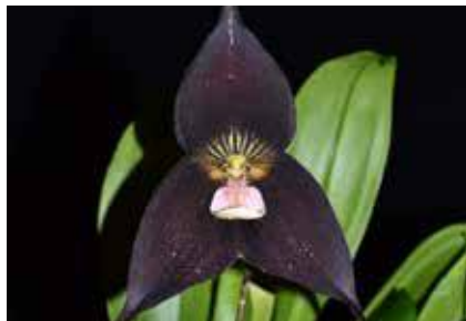
Dracula Maltese Falcon 'Bogey' ( Dracula Raven x Dracula roezlii ) FCC 95