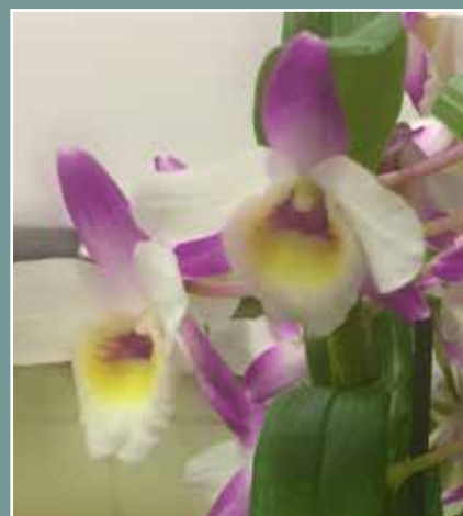
Den. Super Isle [Super Personality] Antonntte Queri