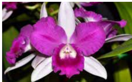
Rhyncattleanthe Rubin's Magic 'Hortensia'

( Cattleya Tropical Sunset x Rhyncattleanthe Laughing Boy ) AM 84