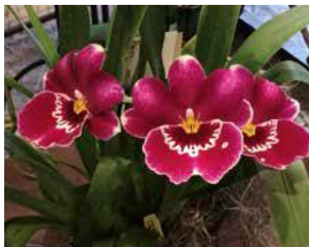
Miltoniopsis Mae Mutsue Nakama