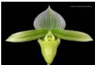
Paph. Oriental Green 'Riesling' ( Paph. Oriental Jewel x Paph. sukhakulii )