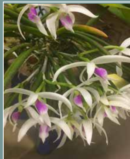
Leptotes bicolor [Fireworks] AM/AOS Jason Douglass