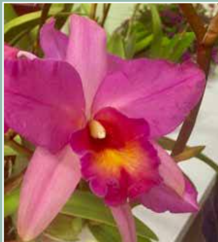
Laelia Coastal Sunset Afterglow Bill Weaver