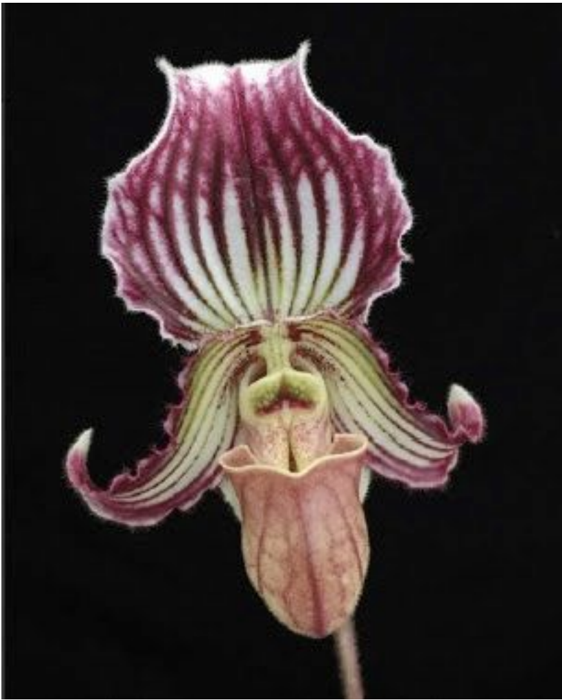
Paphiopedilum fairrieanum - Hillsview Gardens