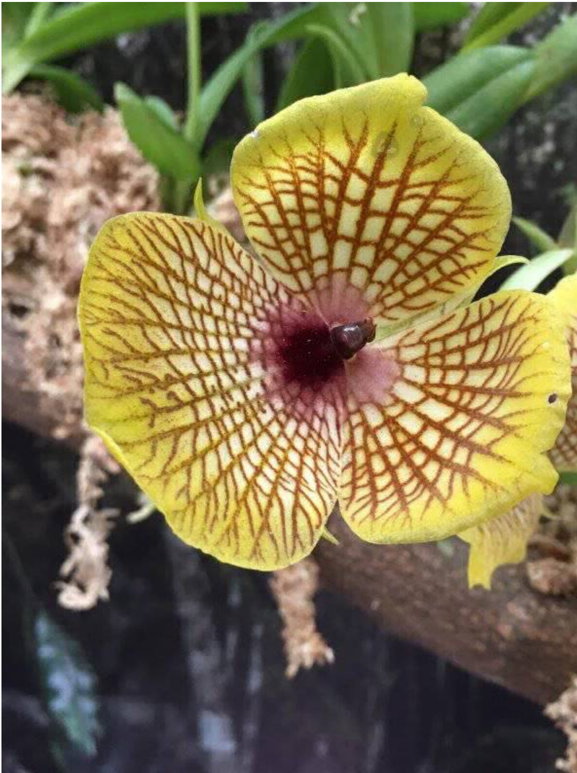
Telepogon hausmannianum - taken at 22nd WOC in Guayaquil, Ecuador