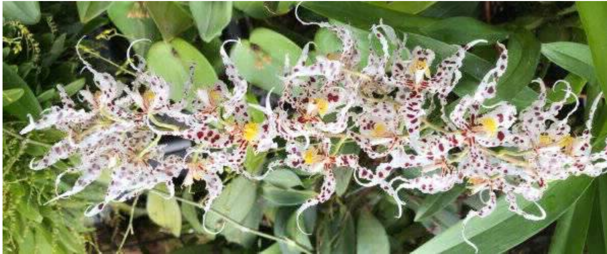
Oncidium naevium - picture by Jeff Harris taken at Ecuagenera Nursery in Gualaceo, Ecuador