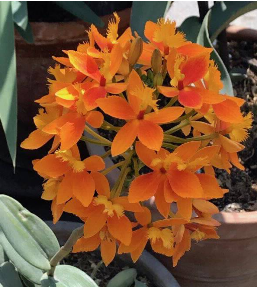
Epidendrum ibaguense taken at Larco Museum in Lima, Peru