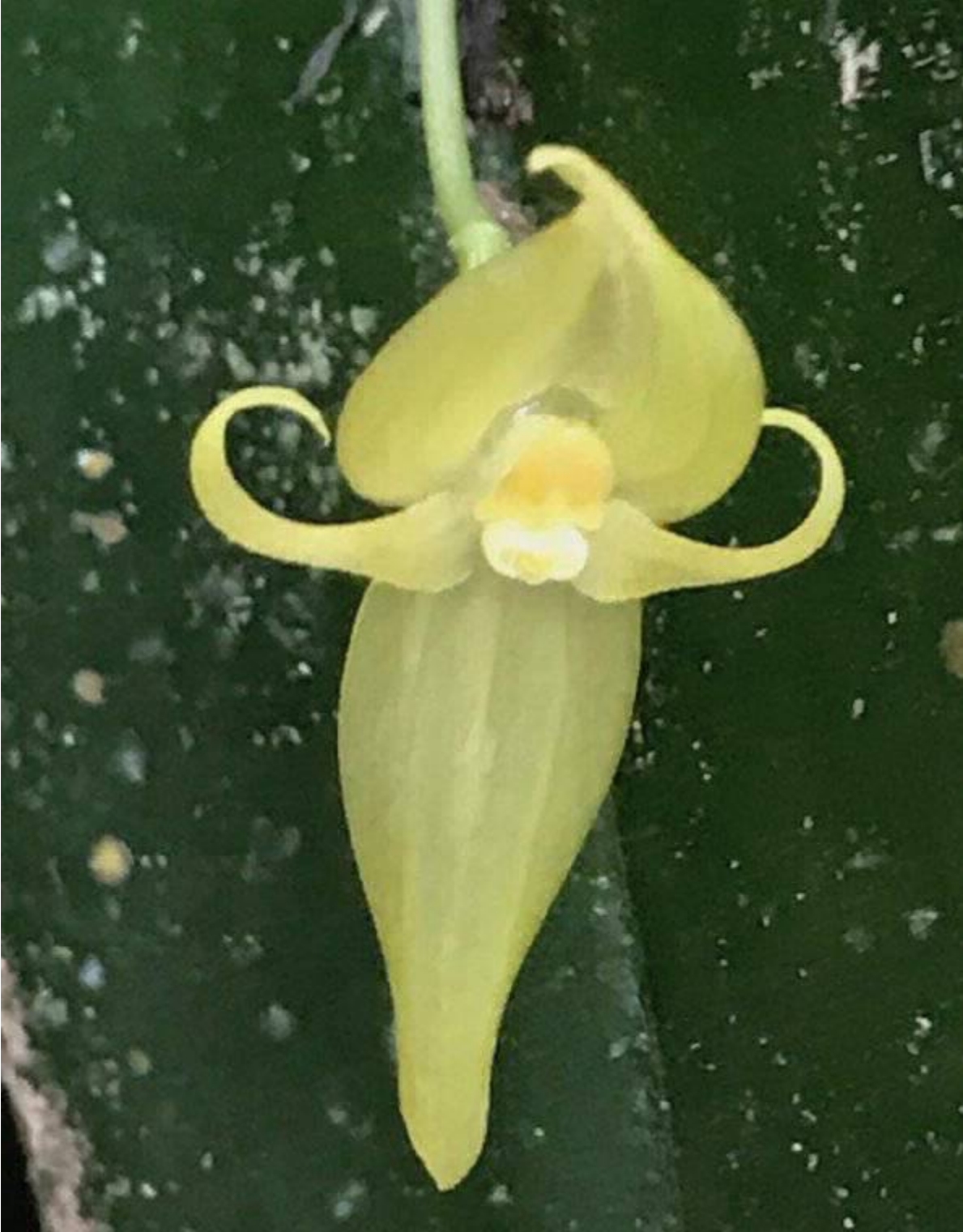
Pleurothallis aff phyllocardioides at Inkaterra Machu Picchu Pueblo gardens