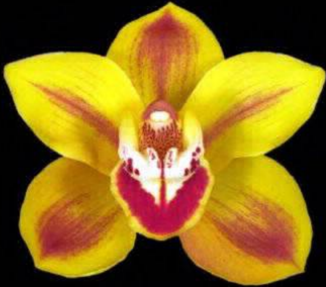
Cym. Tower of Fire 'Sunset Flame'.

San Mateo Garden Center 605 Parkside Way San Mateo, CA 94403