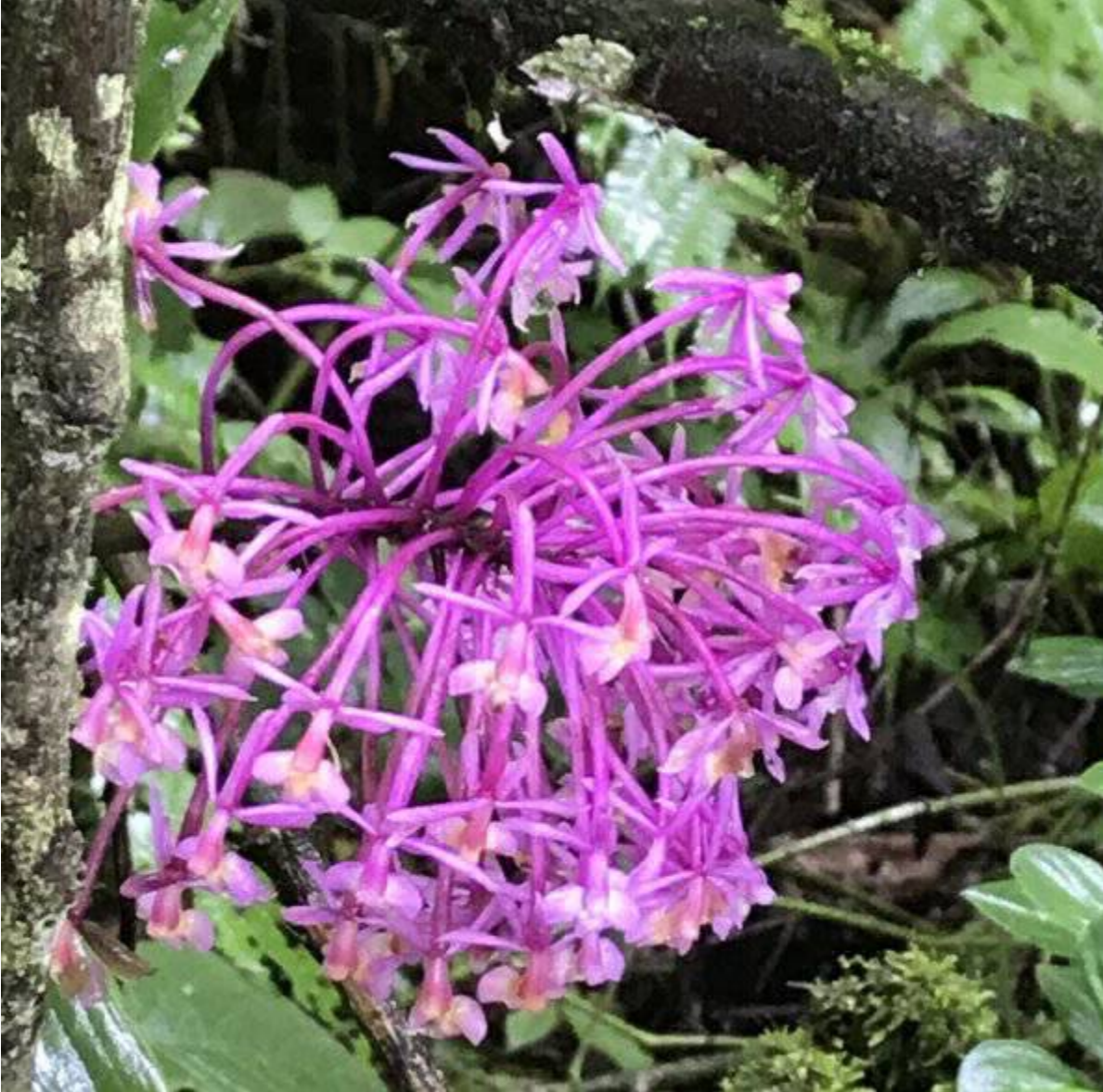
Epidendrum syringothyrsus - picture taken on the Inca Trail by Jeff Harris