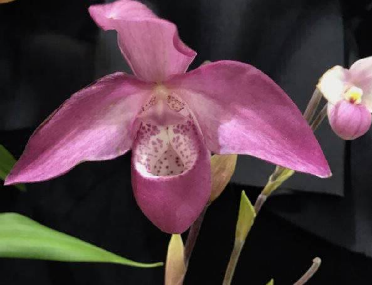
Phragmipedium Ecuagenera Dream taken at 22nd WOC in Guayaquil, Ecuador