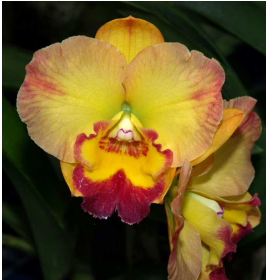
RM-1020 Pot January's Diamond (Pot January's Child X Shin Shiang Diamond) #7a - photo R. Midgett