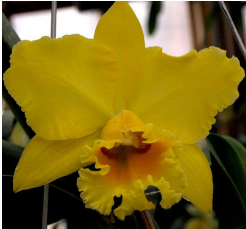
Pot. Jim's Gold 'Diane'