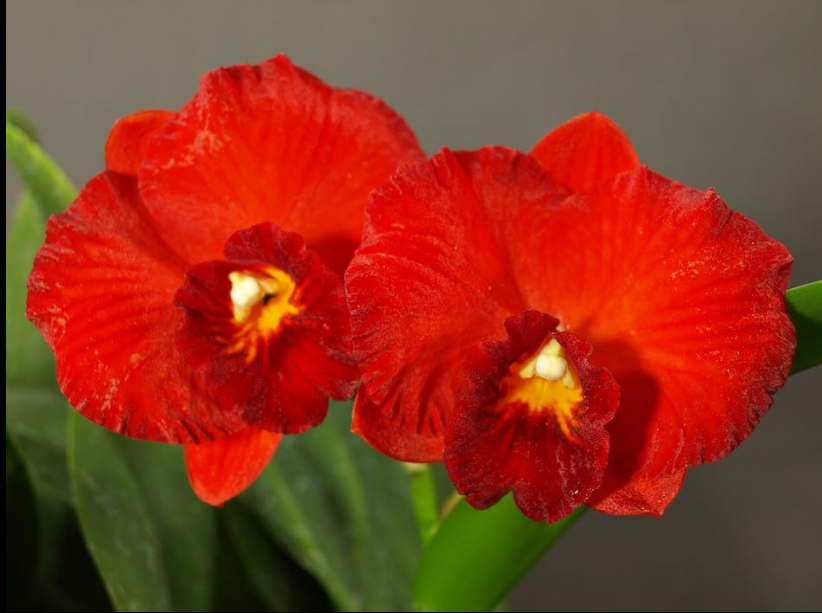
RM-336 Pot Apricot Sands 'Fire Brand' AM_AOS