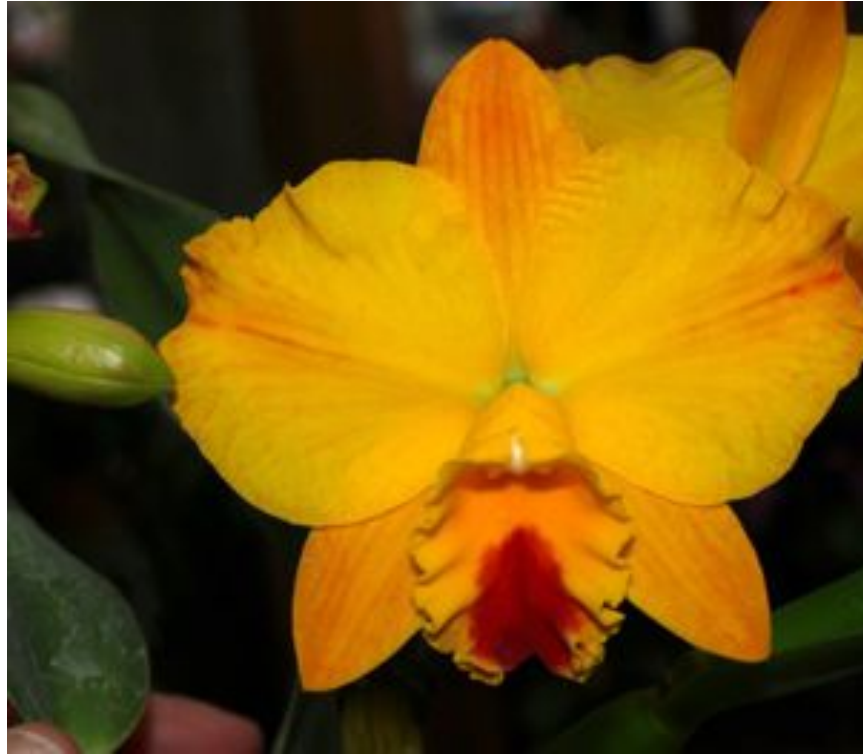
Pot. Apricot Sands 'Outstanding' AM/AOS

The new membership directory is now online on the SFOS website. All members with an