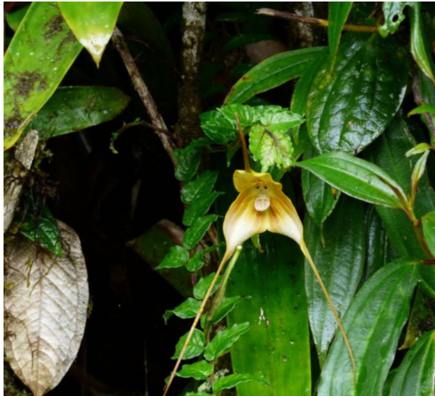
Dracula orchid photographed at the Reserve