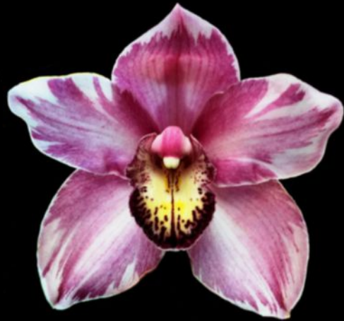
Cym. (Via Fair Vista x Robert Rowe) 'Ruby Splash'

San Mateo Garden Center 605 Parkside Way San Mateo, CA 94403