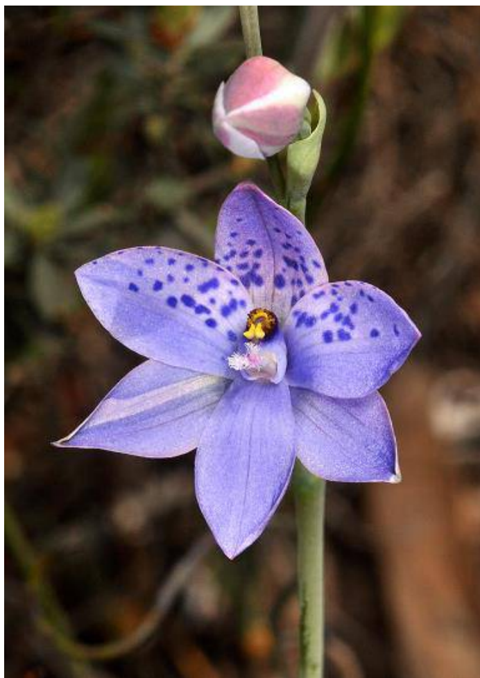
Thelymitra ixioides - Victoria

For five weeks of the austral spring of 2011, from early October to mid-early November, I traveled through southeastern Australia. My trip started on the island state of Tasmania (the north and northwest part) where friends took me out to see and photograph orchids I would not have found on my own. From there I traveled to Victoria where I was taken to Grampians National Park in the west, the Anglesea Peninsula west of Melbourne, and Wilson's Promontory to the southeast of Melbourne, where again many exciting orchids were found. Next stop was Canberra for a few days, then to areas both north and south of Sydney in New South Wales where many fantastic ground, lithophytic and epiphytic orchids were seen. My incredible trip ended with several days spent on the beautiful isle