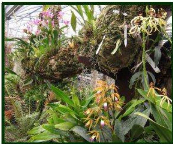
Our outdoor orchid logs in full bloom, Jan. 2012