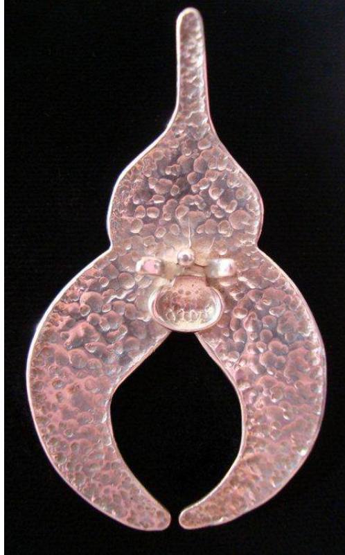
The Eric M. Imperiale Youth Prize Award