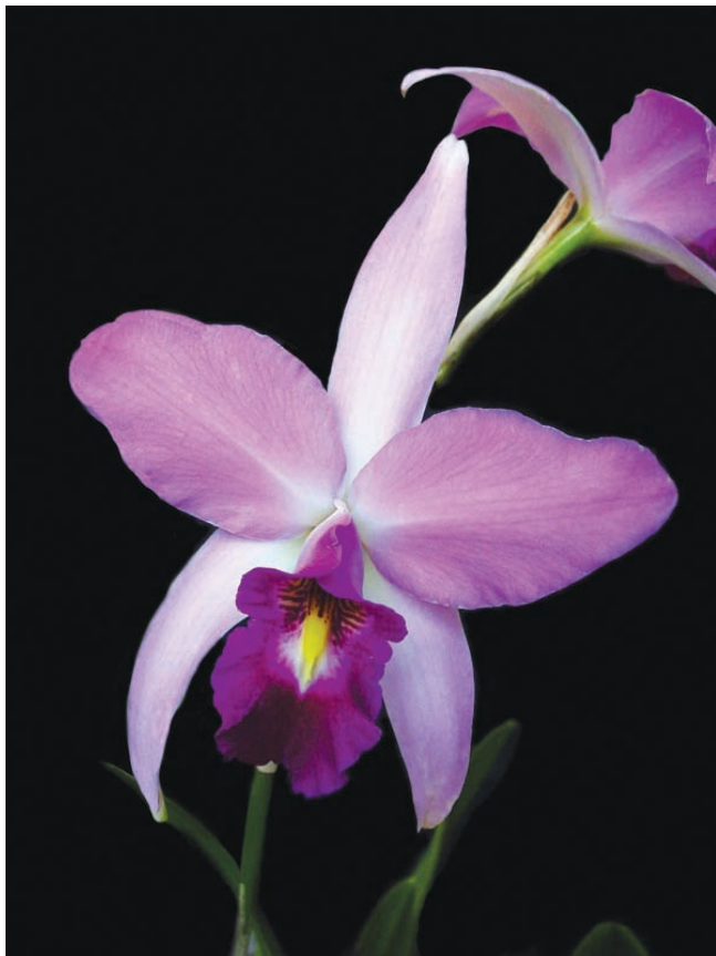
Laelia anceps ('Helen' X 'Ultimo')