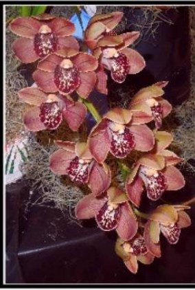
Cym. Crazy Horse Audrey Young-Tarter