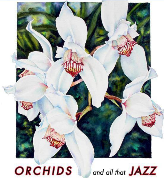
Cymbidium erythrorhizon by Sally Robinson