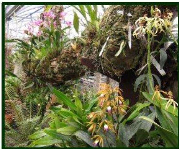
Our outdoor orchid logs in full bloom, Jan. 2012